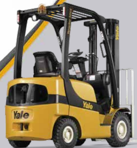
Truck shown with optional equipment